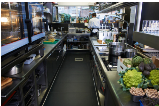
Reduced staffing levels to maintain social distancing